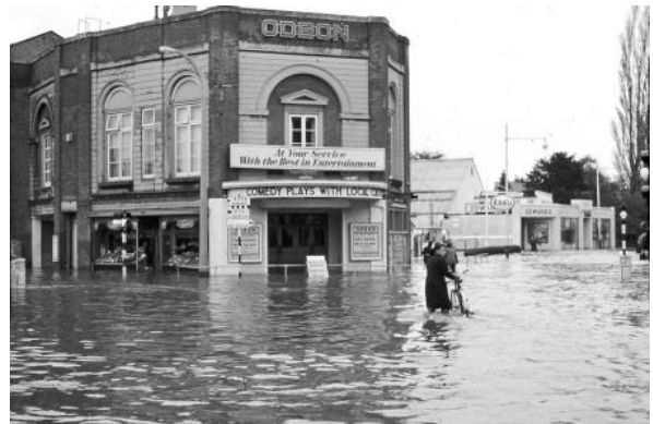
Junction of Bridge St. and Station Rd, Taunton – 1960