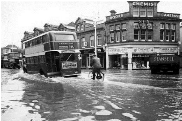
Towards Town Bridge near St. James St, Taunton – 1960

If we do nothing, we may start to see a return to flood events such as those pictured below: