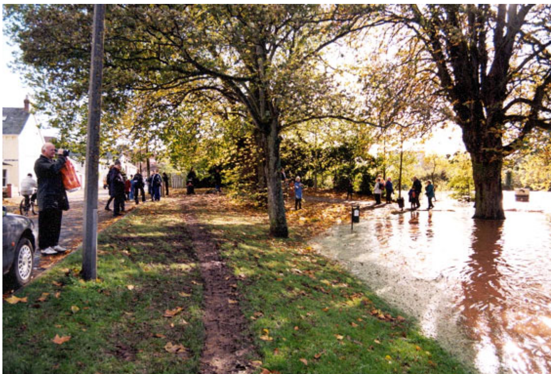
The River Tone comes close to flooding onto Clarence Street, North Town, near French Weir Park in October 2000

Taunton town centre narrowly avoided serious flooding on these occasions, but it experienced significant disruption to many local services such as access to health centres and food stores, as well as impacting local businesses, demonstrating that flooding events do not just impact the inundated area.