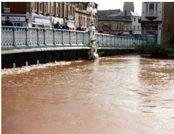
Town Bridge 2012

No. As mentioned in Q1 and Q3 answers, there are many other existing flood risk beneficiaries to consider in the town centre alongside the regeneration site areas.