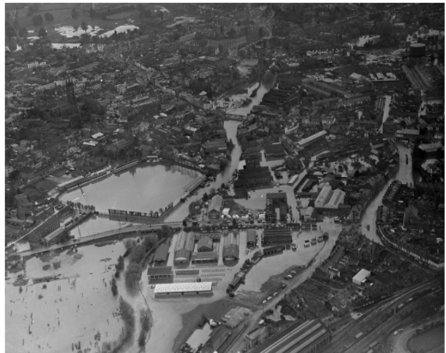
Aerial photo showing flood extent during 1968 event in Taunton

Since the 1960s, less damaging flood events have more recently been observed in Taunton in 2000, 2007, 2009 and 2012. In 2012, notable flooding occurred in Vivary Park and the adjacent Cricket Club.