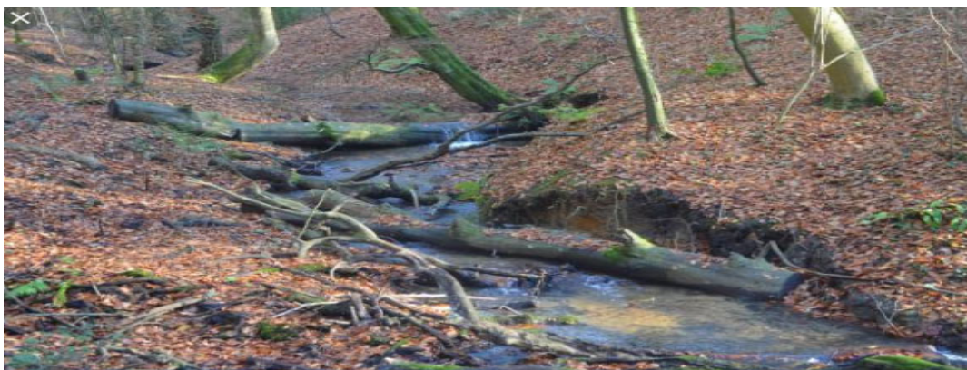
Environment Agency picture of Natural Flood Management

https://catchmentbasedapproach.org/learn/what-is-natural-flood-management/