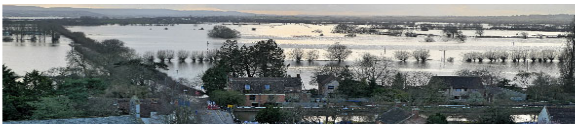
Levels and Moors winter 2013/2014

The modelling analysis of our preferred approach options specifically looked at the impact downstream of the M5, which provides an indication of any likely impacts on the Somerset Levels and Moors. The preferred approach options have no significant impact on downstream flood risk, but will be checked again during any detailed design work. Large flood storage upstream of the town has the potential to 'slow the flow' into the downstream Levels and Moors area.