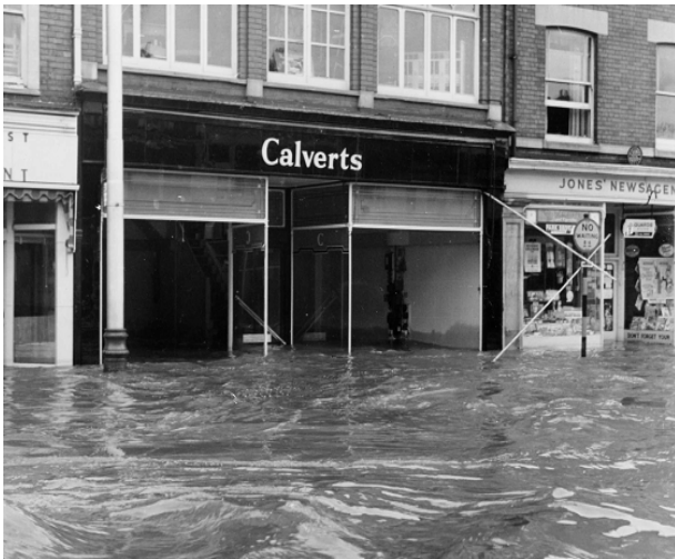
Calverts furniture shop, Station Rd – 1960