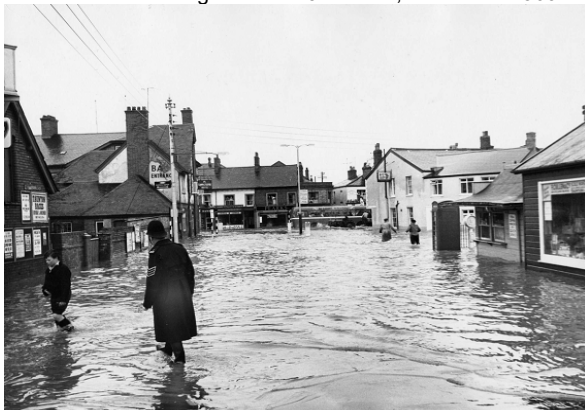
Priory Bridge Road junction with Canal Rd / Station Rd. – 1960