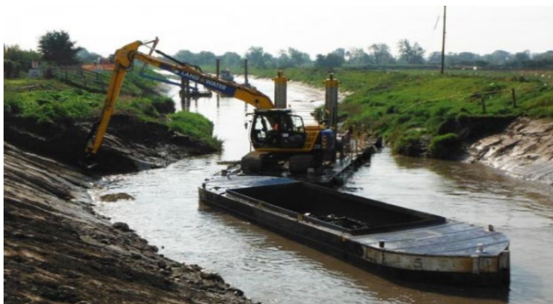
Conventional Dredging on the River Parrett in 2014

Dredging, and other types of watercourse management such as de-silting and vegetation removal have been considered when assessing how to manage existing and future flood risk in Taunton. Dredging has to be prioritised and justified technically, environmentally and economically.