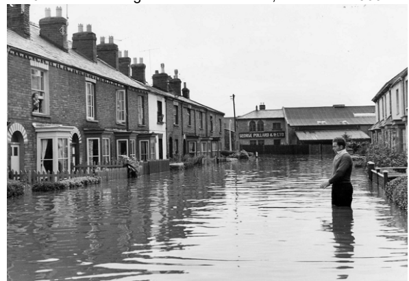
North Town (Cleveland Road or Greenbrook Terrace) - 1960